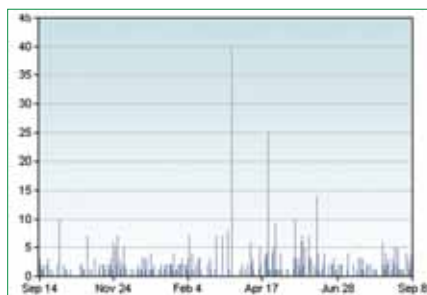
Figure 3: Weblog postings per day about informetrics (from September 14, 2005 to September 8, 2006)

„Informetrics" and the other mentioned terms are also well known in the blogosphere and broadly discussed. We looked for informetrics OR bibliometrics OR scientometrics OR webometrics OR „retrieval evaluation" in the full-texts of blogs indexed by Technorati. The blogometric time series of blogs per day produced by Technorati is shown in figure 3.