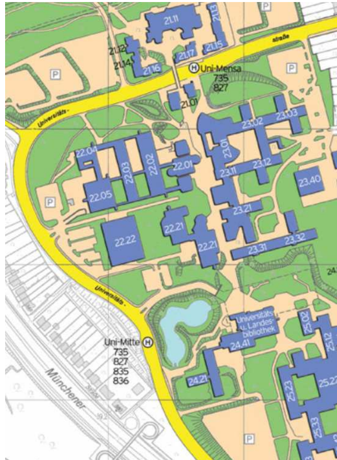
Map of Heinrich-Heine-University

For further information: http://www.japaspora.uni-duesseldorf.de